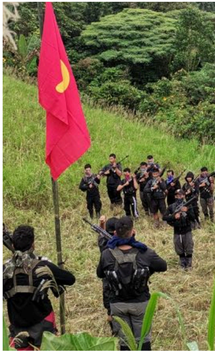
Red fighters pay tribute to Ka Joma, December 19, 2022

At every major shift of its economic policy in East Asia, US imperialism has always made it a point to prevent the economic development through a